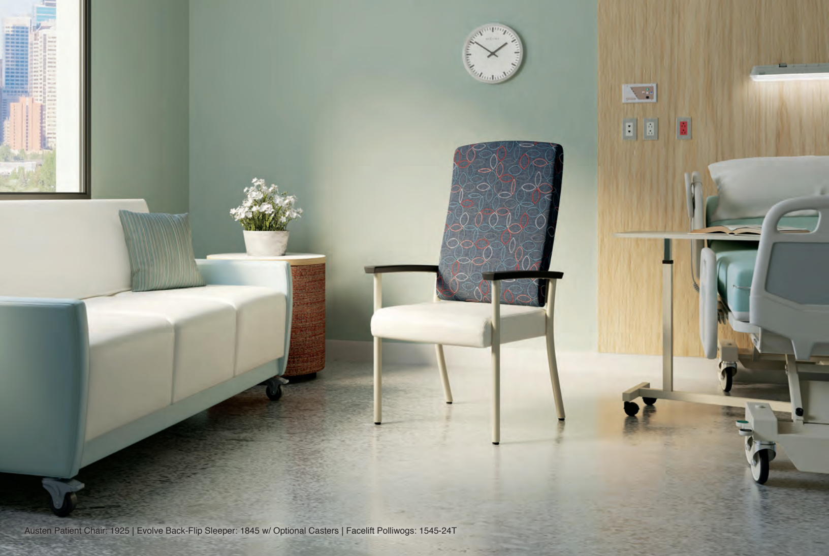
Austen Patient Chair: 1925 | Evolve Back-Flip Sleeper: 1845 w/ Optional Casters | Facelift Polliwogs: 1545-24T