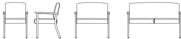
1922 Side Chair (Wallsaver)